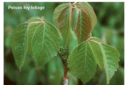
Poison Ivy foliage